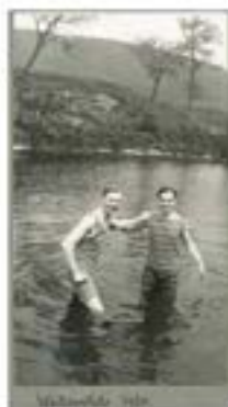
Swimmers at Appletreewick, 1930'

Celebrate all things holiday from trains to postcards and photos to seaside activities. Find out how the industries of Staffordshire influenced holidaying in this fun, interactive exhibition.