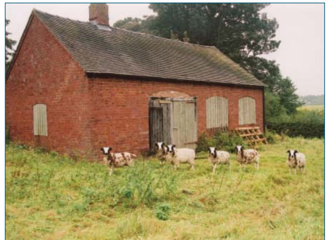
Farm building at Betley Old Hall Farm