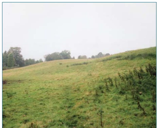
Field to the north of Betley Old Hall

(i) The first is highly visible from Main Road and whilst it is already protected by Policy S3 in the Local Plan, the field deserves special recognition as affecting the setting of the conservation area as well as providing a break between the village centre and the small hamlet of Buddileigh.