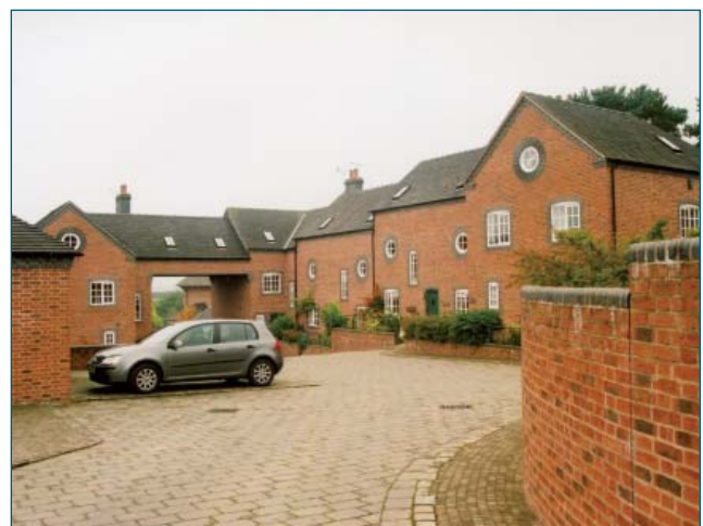
Modern development off Common Lane