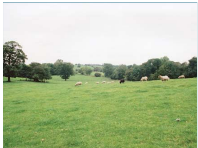
Landscape setting to the south west of Betley