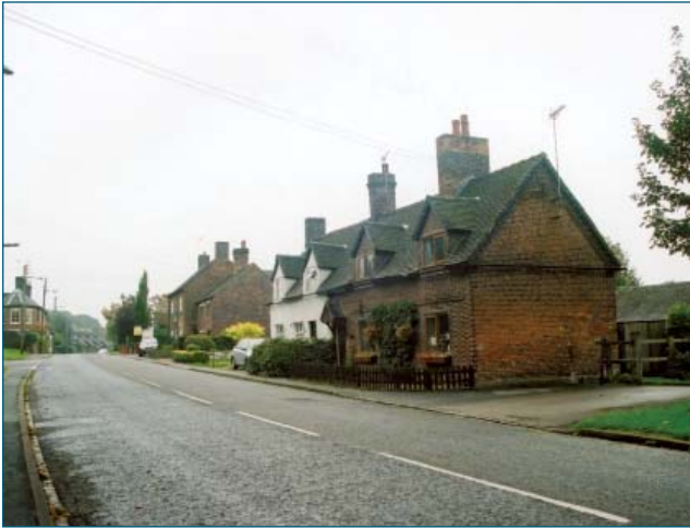
Some gardens have been converted to car parking