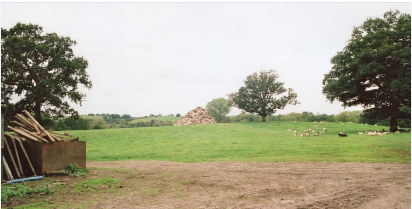
Field to the south west of Betley Court