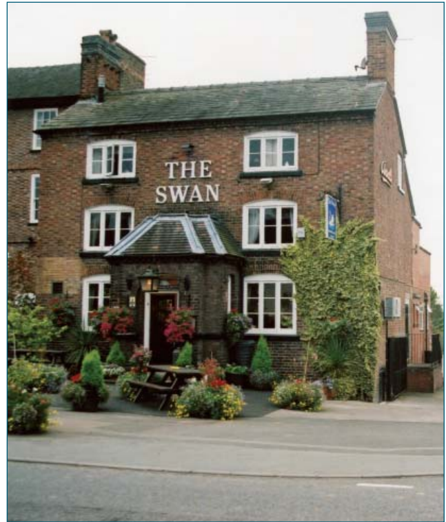
Visible satellite dish on The Swan