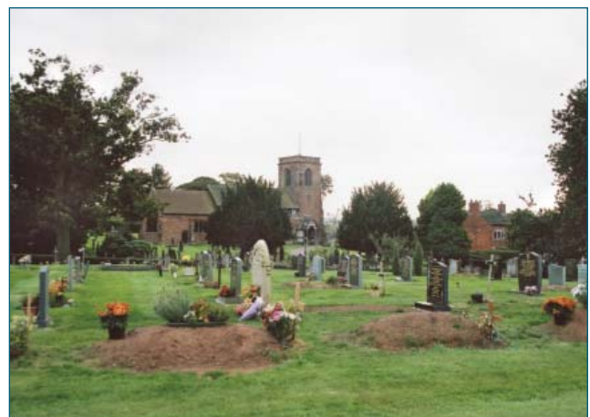
Graveyard to St Margaret's Church