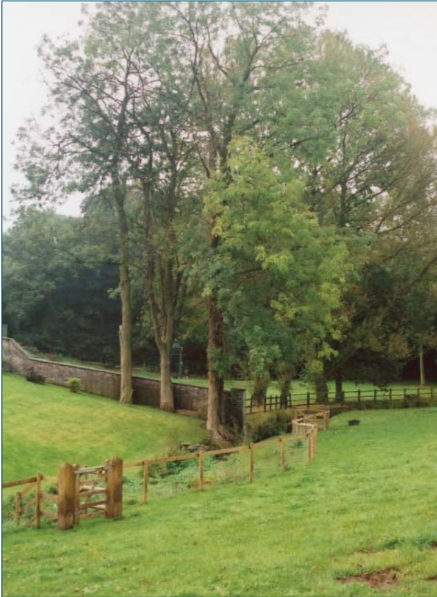
Land next to the brook, Common Lane

The brook forms a natural boundary and encloses land of landscape value, important to the setting of the existing conservation area.