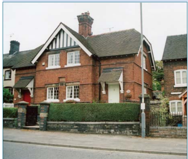
Village houses on the Main Road (Myrtle Cottage)