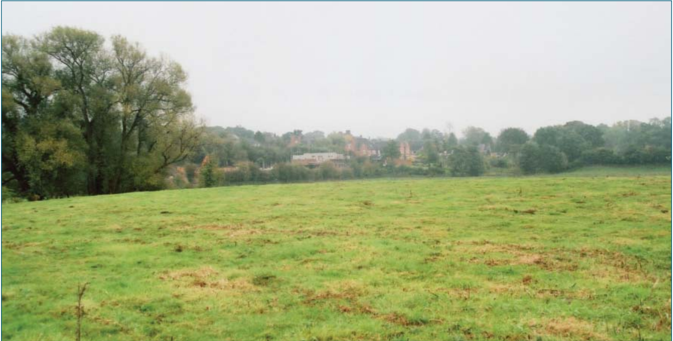
Field to the south of Model Farm

(iii) The third is an area of fields and woodland which helps form the setting to Betley Court when viewed from the fields to the south-west. Some of this land was once part of the more expansive landscaped gardens to Betley Court.