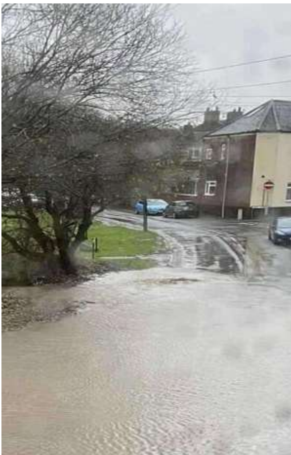
Bignall End Road, manhole cover lifting and flooding road Nov 2024

The Londis convenience store frontage on Ravens Lane regularly floods when there is a downpour because the drains cant cope as does Bignall End Road, down the side of the Plough public house. One resident had to have a wall built to prevent his home being flooded.