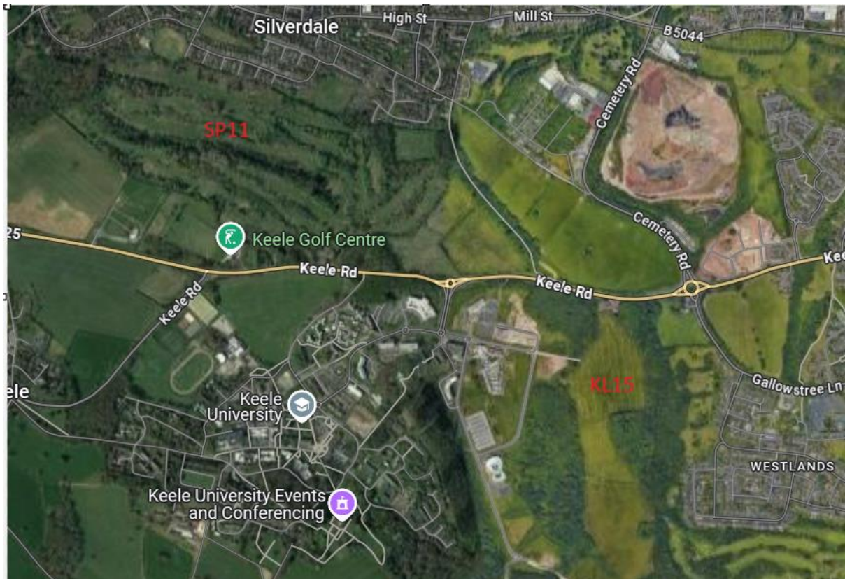
Google image of SP11 & KL15

I would implore NUL council to rethink the strategy for SP11 (in particular SP11 1 & 2) and either remove it from plans or scale it back significantly letting as much of this land as possible be made accessible to be used as an open space / parkland.