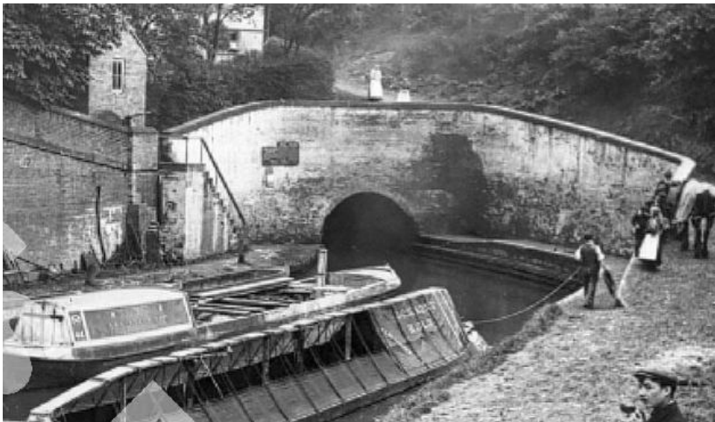
Brindley Tunnel c.1900